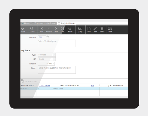
Forecast Analytical Entries

Forecast Accounting works in perfect synergy with the Fixed Assets module, so you can also post in company's forecast accounting the depreciation quotas due at a certain date in the financial year. These quotas often have a great influence in the profit or loss calculation: that's why, Mago4 allows you to post them in forecast accounting, in order to have at any time a better control over the actual performance of the company's real balance trend.